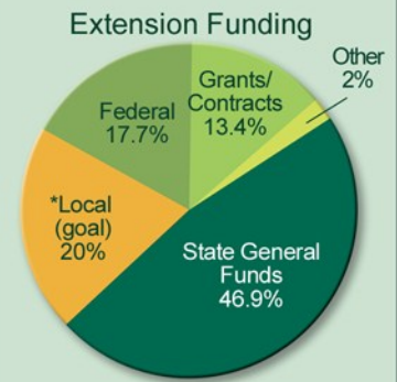
*Local Funding Parish Consolidated Government Parish School Board